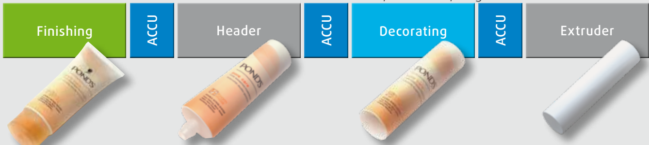
Standard sleeve in-line configuration for tube production