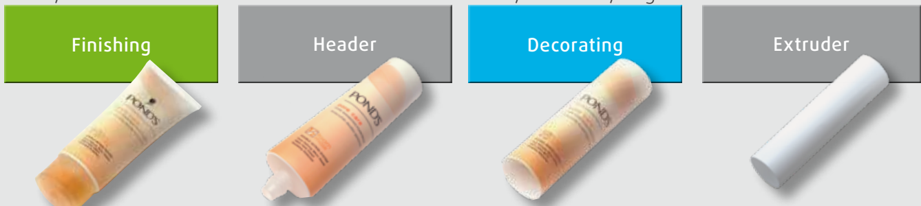
Sleeve off-line configuration for tube production