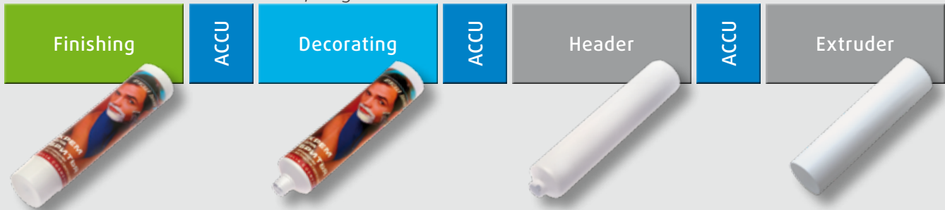
Standard in-line configuration for tube production