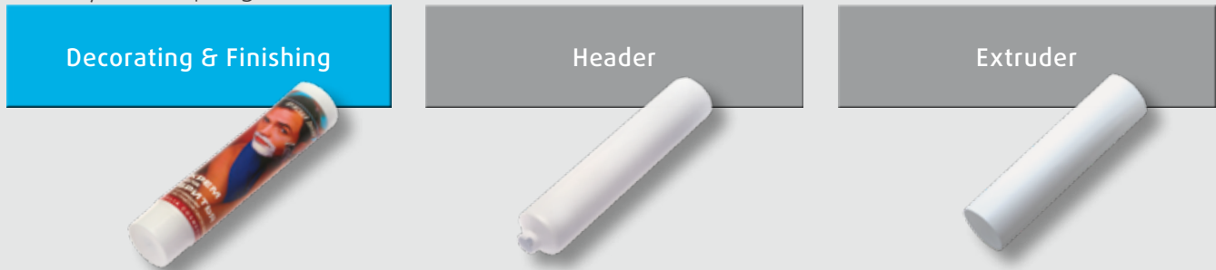
Ergonomic off-line configuration for tube production